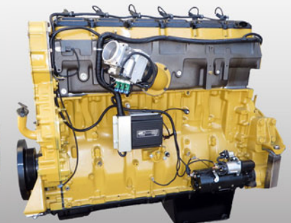
Caterpillar 3406E, C15, C16