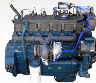
Navistar DT466E, DT530E