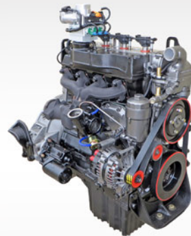
Mercedes OM904, OM906